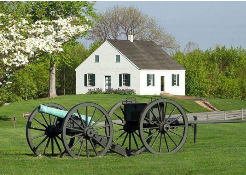
Above is the Dunker Church as it stands now.