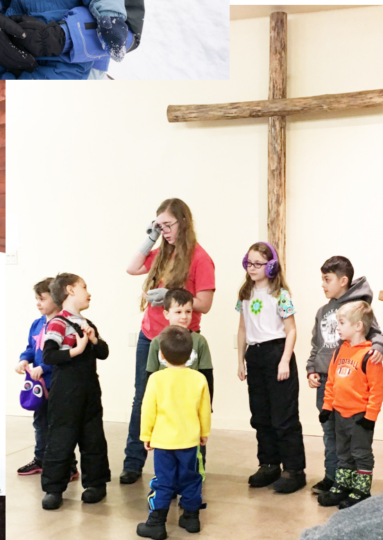
Right: Group of district youth singing in meeting hall