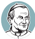
John Paul II