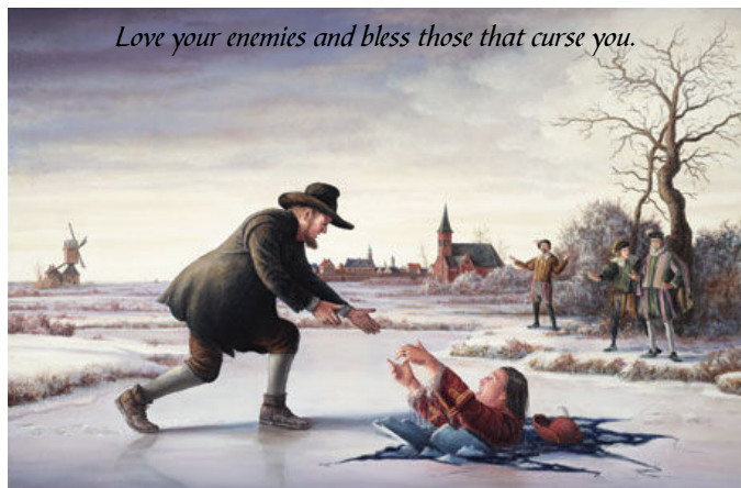
Love your enemies and bless those that curse you.

Prayer: God of all people who on earth do dwell, help us to sow seeds of love where hatred lurks and reigns. Grant wisdom and courage for the living of these days. Amen.