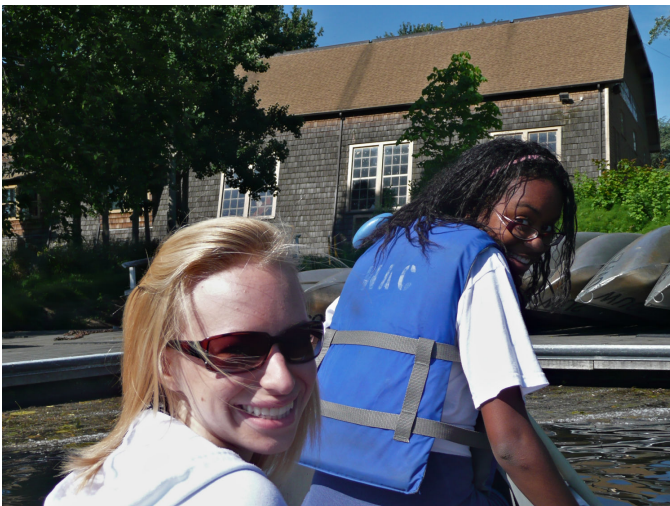
Olympic View youth at a recent canoe outing.